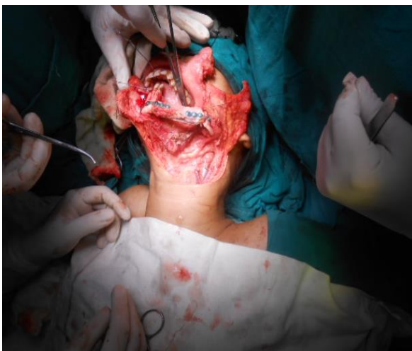
Fig. 8: Showing iliac crest grafting with Plating after segmental mandibulectomy