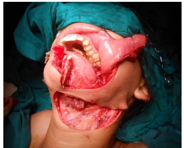
Fig. 7: Showing left side segmental mandibulectomy