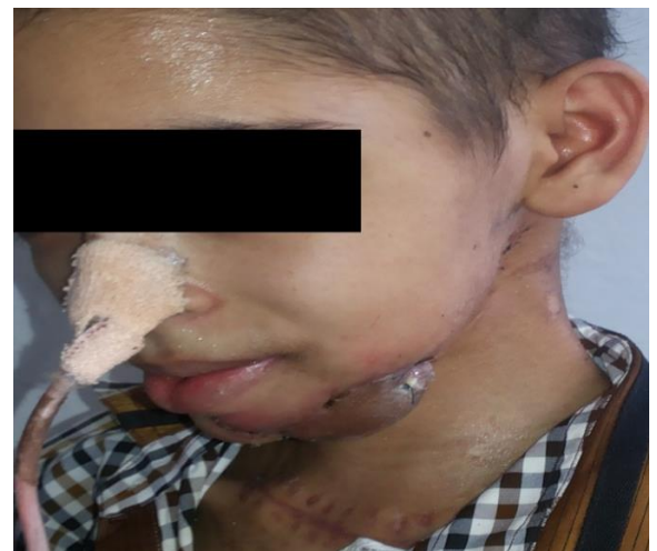
Fig. 9: Post-operative patient after detachment of pedicle of PMMC flap