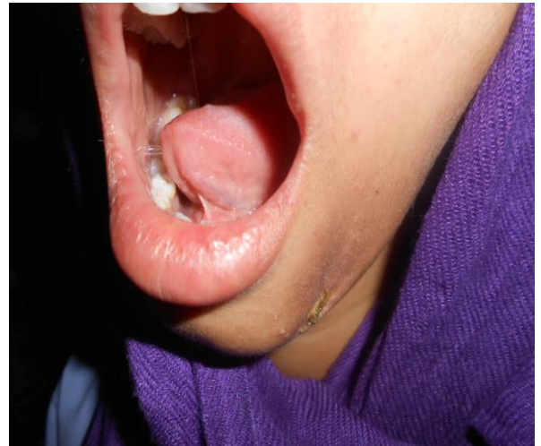
Fig. 2: Intra oral lesion